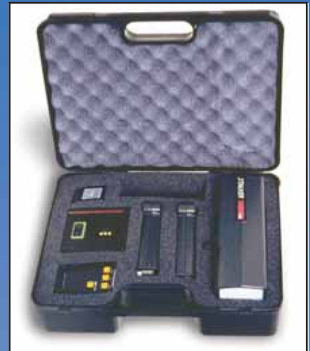
Standard Carrying Case is Included