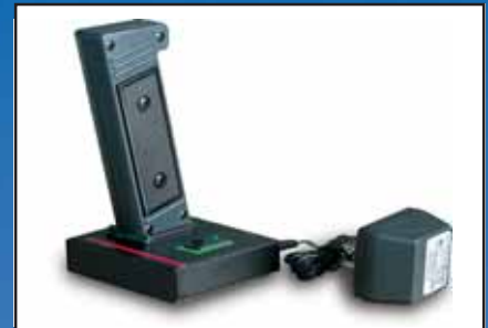
Intelligent Battery Charging System

Hand Controller Auxiliary Remote Display Corded Handle Corded Handle with Connector Power Adaptor Module Ni-Cad Battery Handle Double Capacity NiMH Battery Handle Smart Charging Platform Battery Discharger Short Dash Mount Long Dash Mount Caprice Mount Shock Mount Locking Kit Motorcycle Mounts (Handlebar & Crashbar Versions - various bar diameters) Nylon Holster Standard Carrying Case Deluxe Waterproof Case Speed Commander Display Tuning Fork Pouch