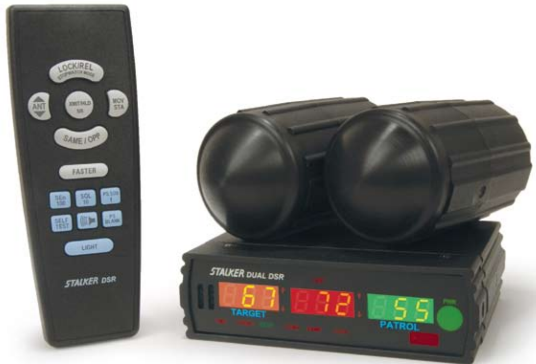
The Revolutionary Stalker DSR