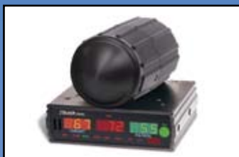
Sophisticated Ka Band Antenna

Performance That Leads the Industry From the Industry's Leading Manufacturer