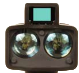
High Powered Optics: The Heart of the LIDAR RR