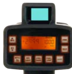
Speed and Range in Heads-Up Display