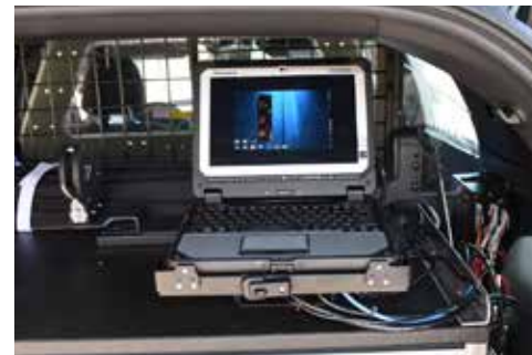
Cargo area-mounted laptop and integration