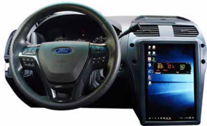
The Havis Integrated Control System (developed by a partnership of Ford, Lectronix, and Havis) in the 2013 and later Ford Interceptor Sedan and SUV