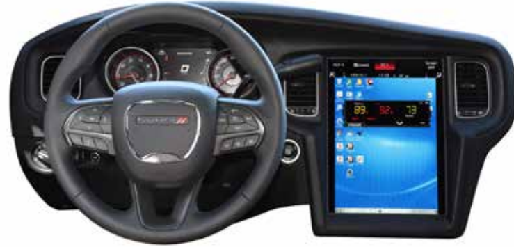
The 2016½ and later Dodge Charger Pursuit with the Uconnect® 12.1 system